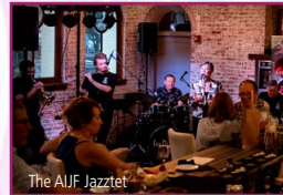
The AIJF Jazztet