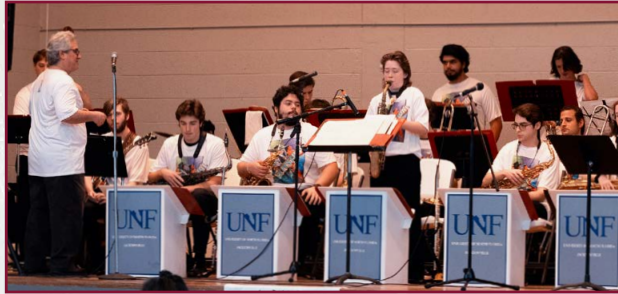
University of North Florida Jazz Ensemble 2 at the Jazz at the Atlantic Rec Center