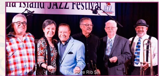
The Spare Rib Six