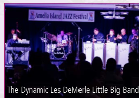
The Dynamic Les DeMerle Little Big Band

Featuring: The Dynamic Les DeMerle Little Big Band with Bonnie Eisele - vocals